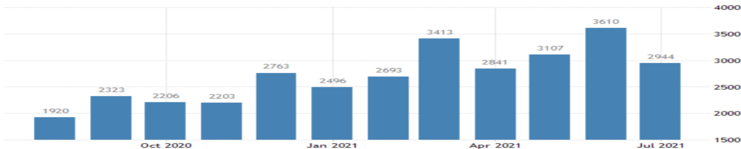
Egyptian Exports (USD Million)